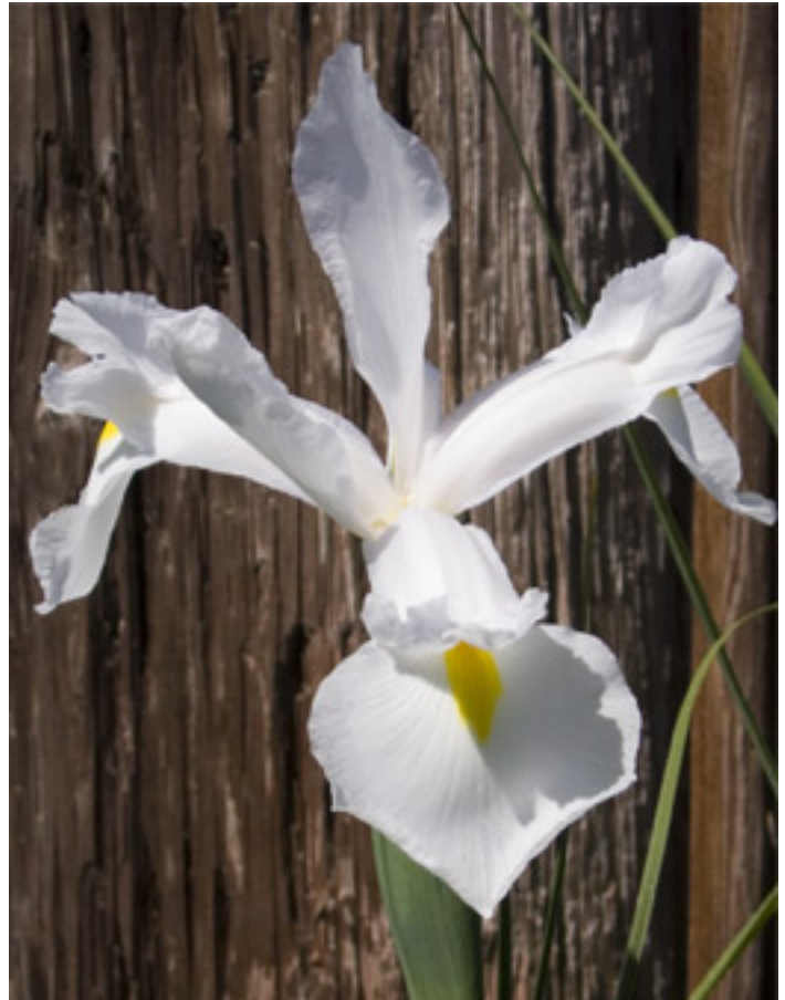
Dutch iris catching one the few moments of sun this month

A modern design (designer's choice): Can be Parallel, synergistic, Angular, Hanging, Reflective, Transparent or Underwater.