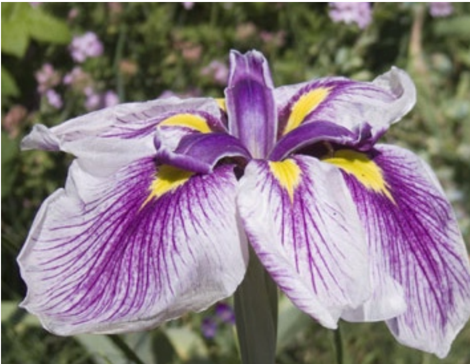
Japanese Iris, Temple Bells in a field of Rose Geraniums

http://www.irises.org/photocontestmain.htm