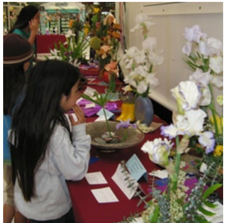
Arrangements are a big crowd draw again this year