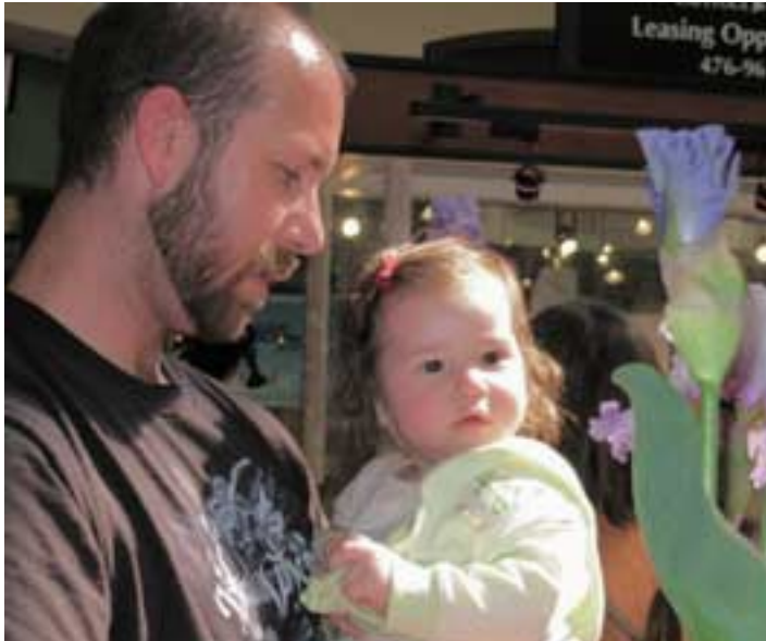
Young iris fan admires blooms at the Iris Show