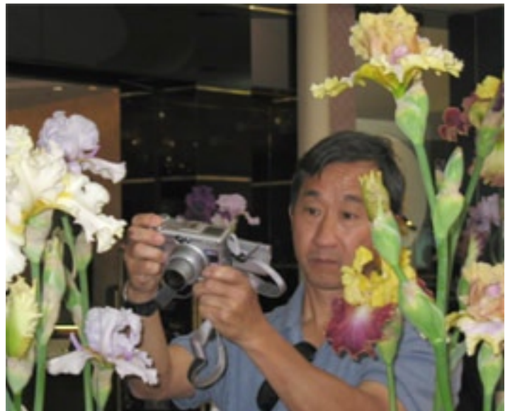
Bay Area Iris Society member photographs iris at our show