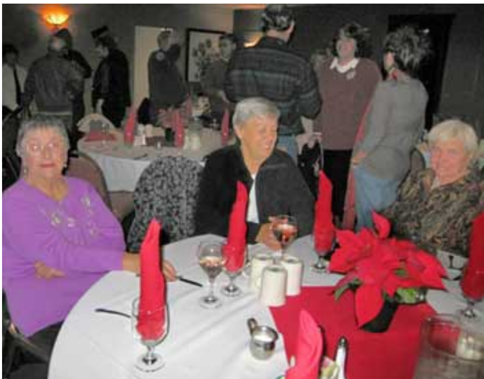
Fun and conversation at the Christmas Party