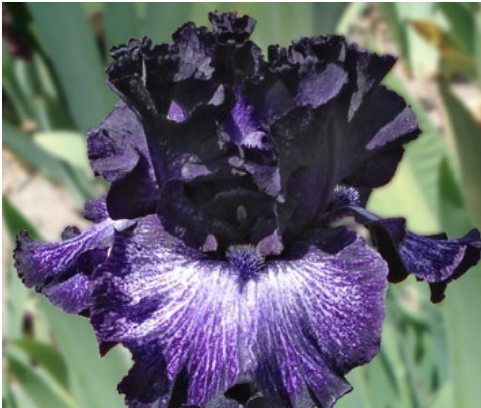
Wedding Night, Ghio, 2009

Deadline for March is an early one, Friday February 28th.