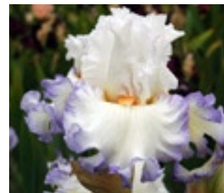
Round of Applause