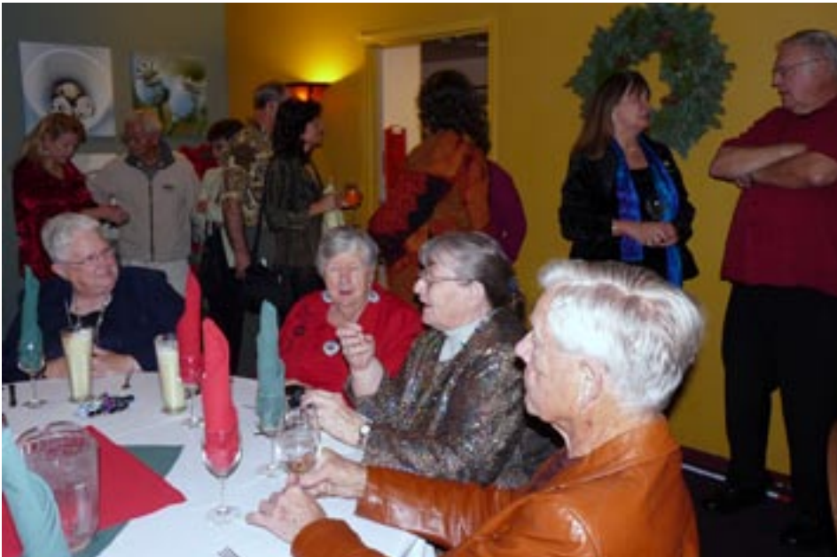
Fun and conversation at the Christmas Party