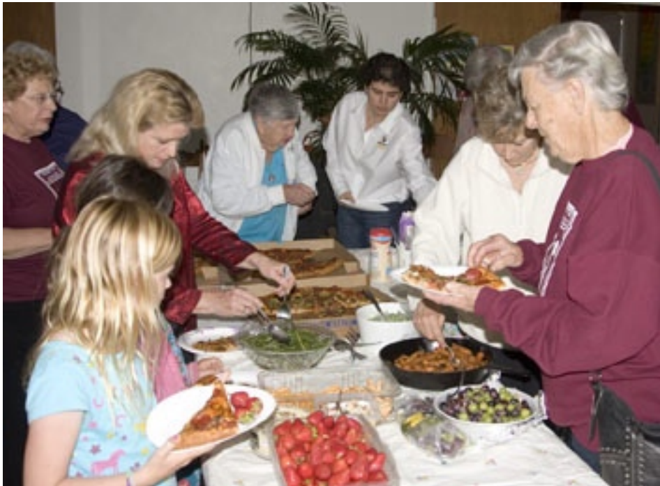
Members enjoy the spread at the Pizza Night celebration