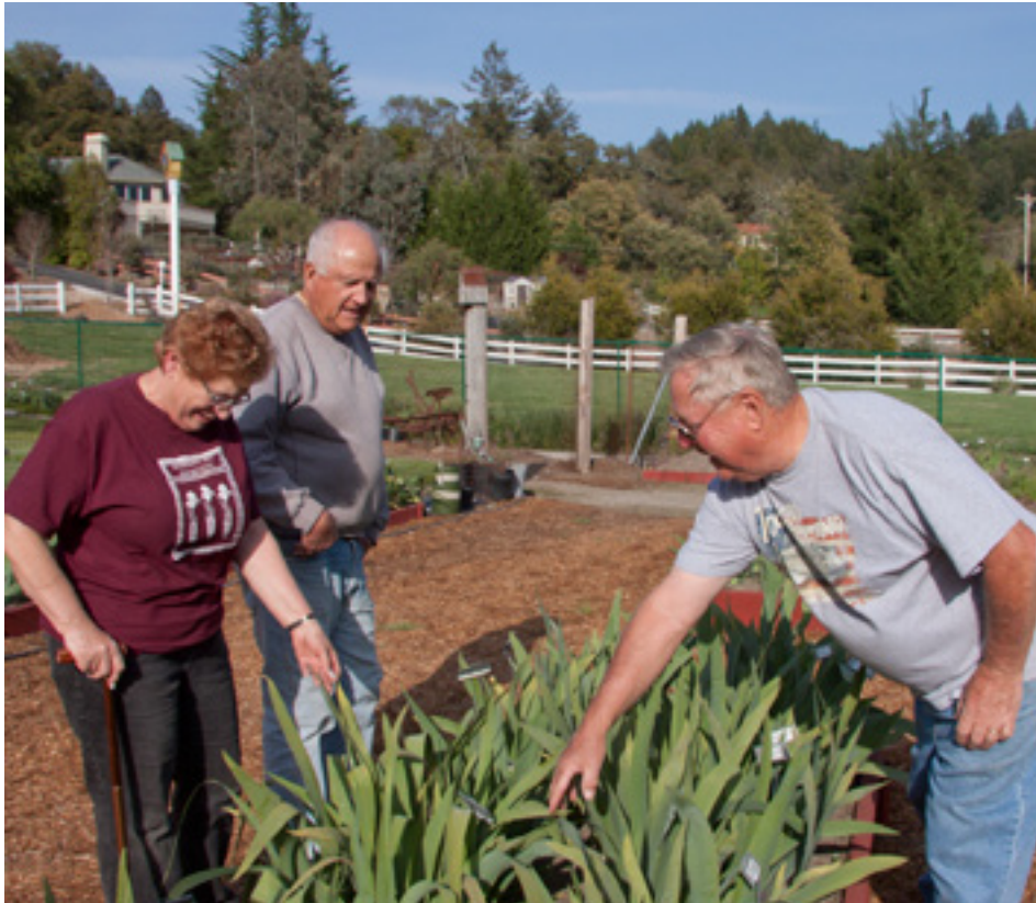
Our three Regional garden hosts do last minute iris check

Newsletter of the Monterey Bay Iris Society