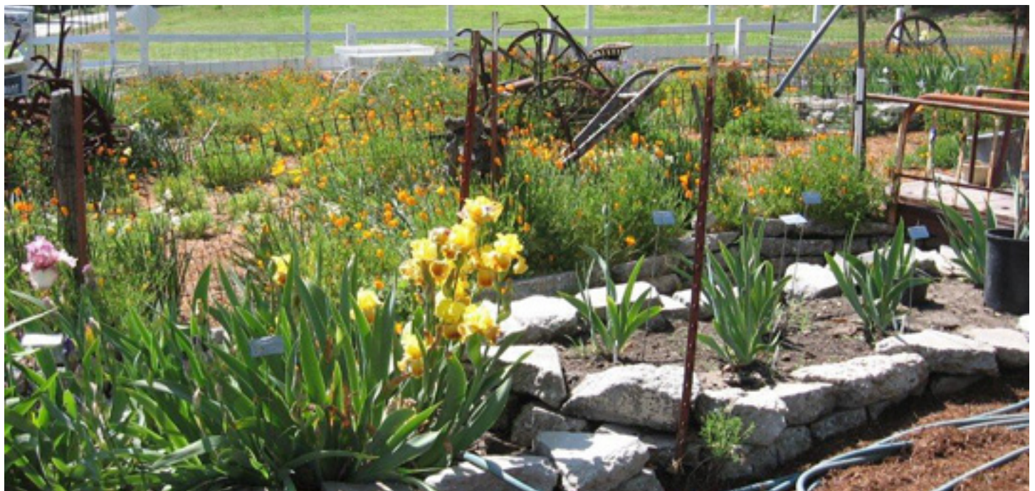
Cummins garden ready for the Regional

Also check you labels and charts that your irises are correctly labeled. Mistakes happen! With digital cameras, it is easy to take pictures of your blooms. This helps to record and correct identification. Once mistake is found, correct it if possible or at least note the error and see if someone can help correctly identify it. 🌸🌸 Joe