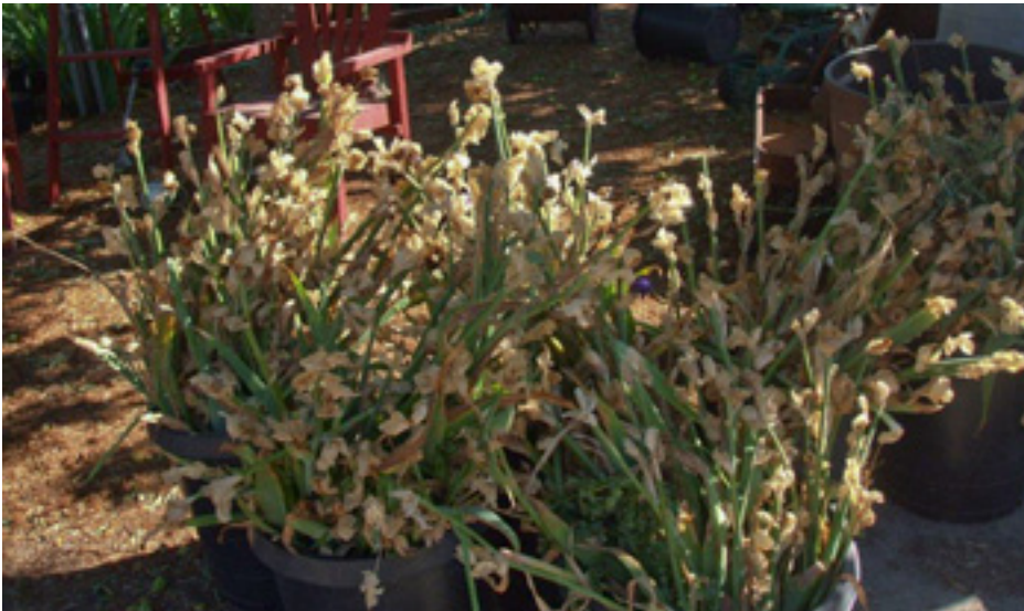
Flower arranging 101

Bring veggies sides, salads, or fruit! Maybe a desert!