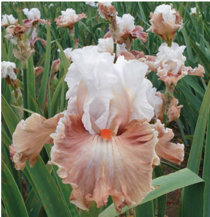
Magic Mirror, Ghio, 2015, Tall Bearded Introduction