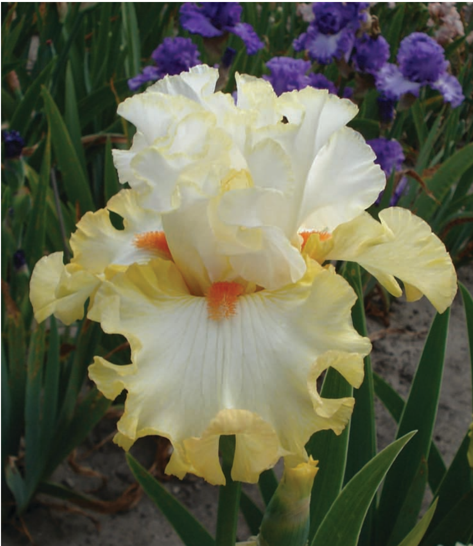
Layer Cake, Ghio 2015 Tall Bearded introduction