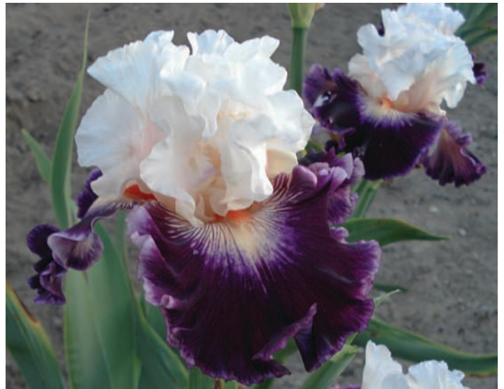
Big Picture Ghio, 2015, Tall Bearded Introduction