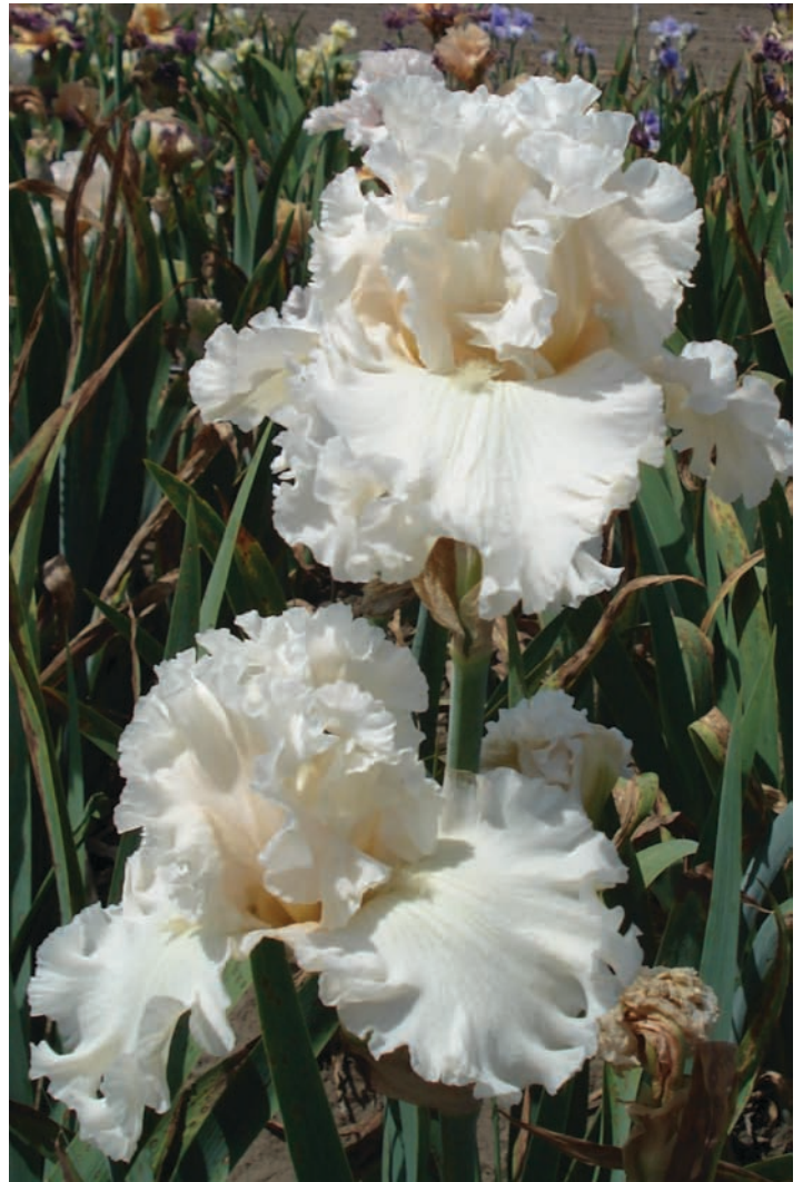
Gentle Soul, Ghio, 2015, Tall Bearded Introduction