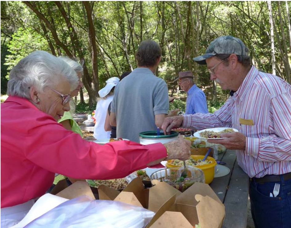
Potluck and picnic in a great new location!