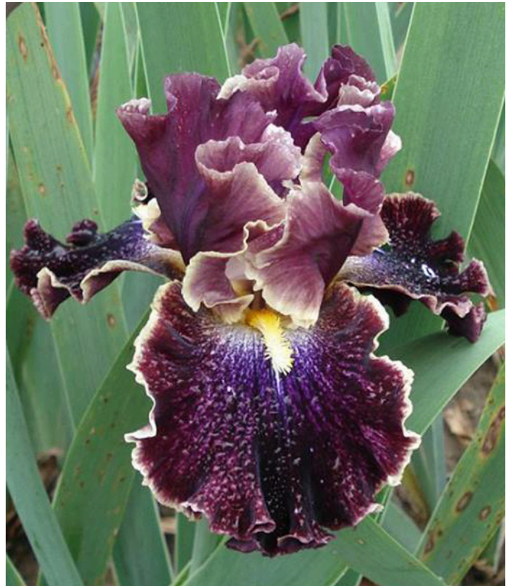
Exploding Galaxy, Ghio, 2016