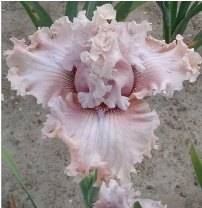
Chivalirous, Ghio, 2016