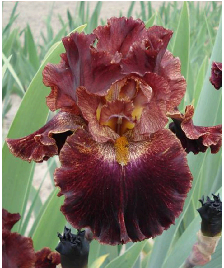
Front of the Line, Ghio, 2016