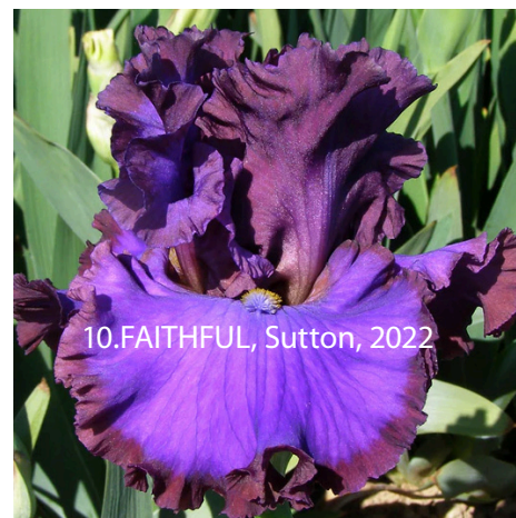
10. FAITHFUL, Sutton, 2022