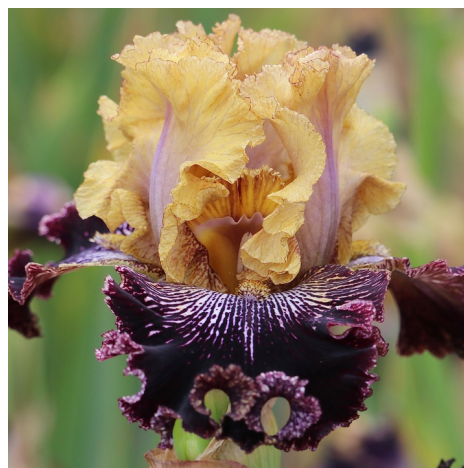
3. BE YOURSELF, Black