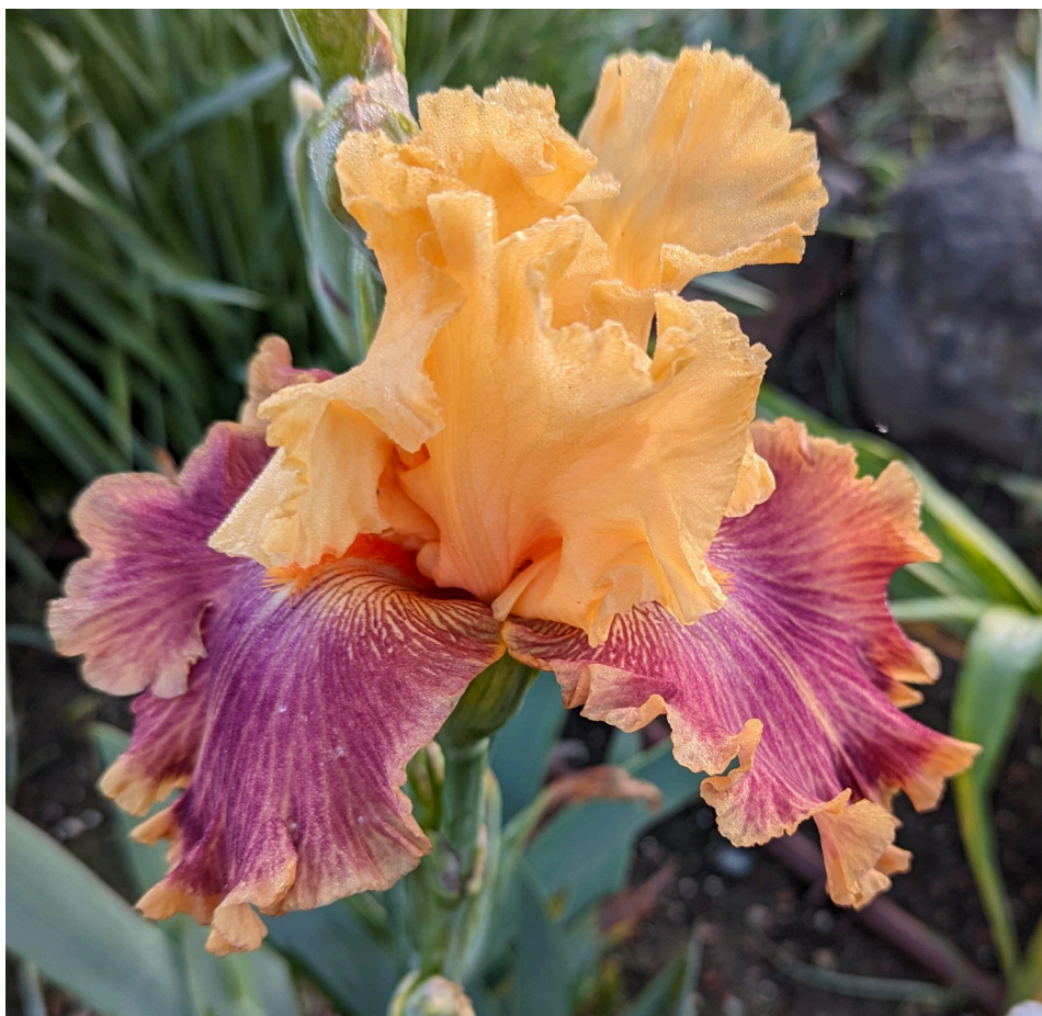
Bottle Rocket, Sutton, 2010, Dykes winner 2019