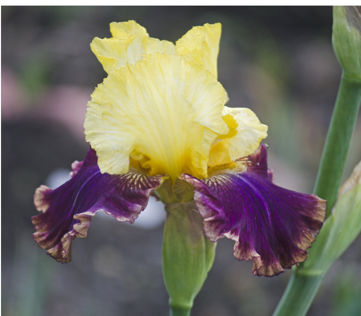
Electromagnetic, Sutton, 2019