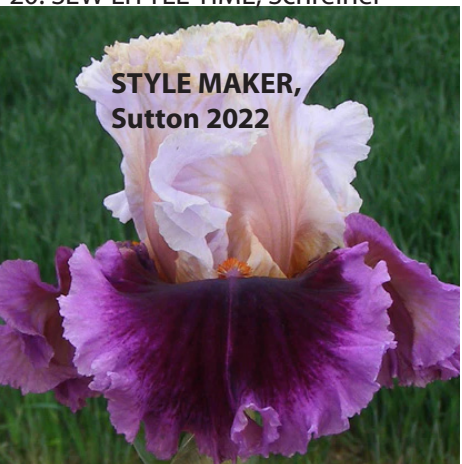
STYLE MAKER, Sutton 2022