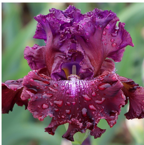
2. APPLE OF MY EYE, Black