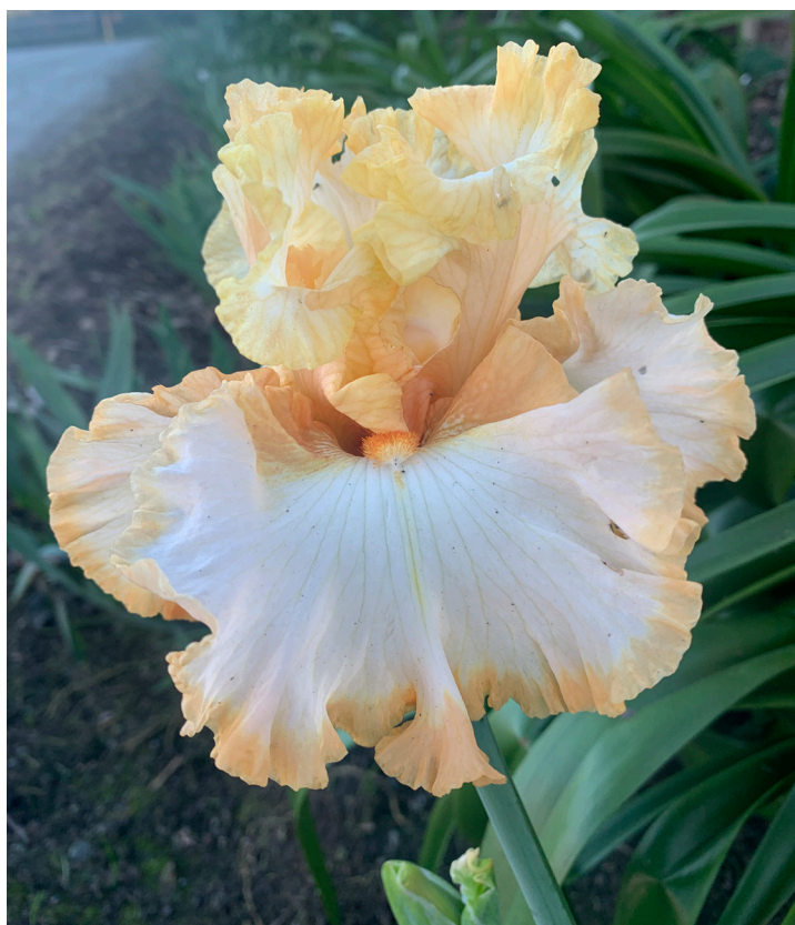
Mammoth Orange, Sutton, 2017