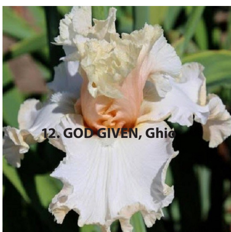
12. GOD GIVEN, Ghio