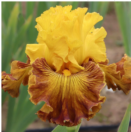
8. EARTH AND SUN, Black