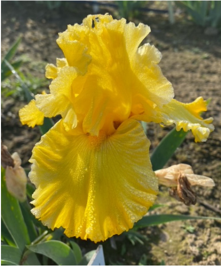
Pure as Gold, Marriott, 1989 T. Rush