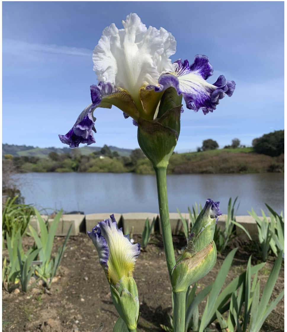
Grand Bargain, Sutton, 2014