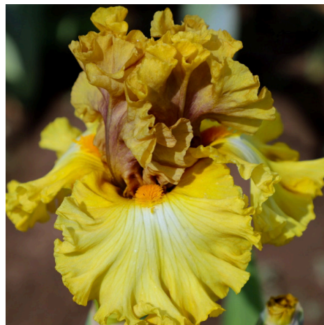
27. WELL TO DO, Keppel, 2022