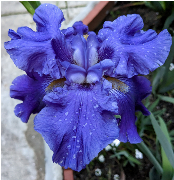
Pin Striped Suit, Probst, 2020