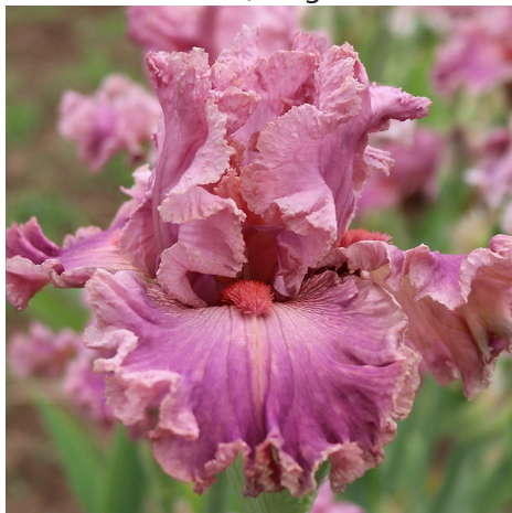
7. DAMSEL IN LACE, Miller