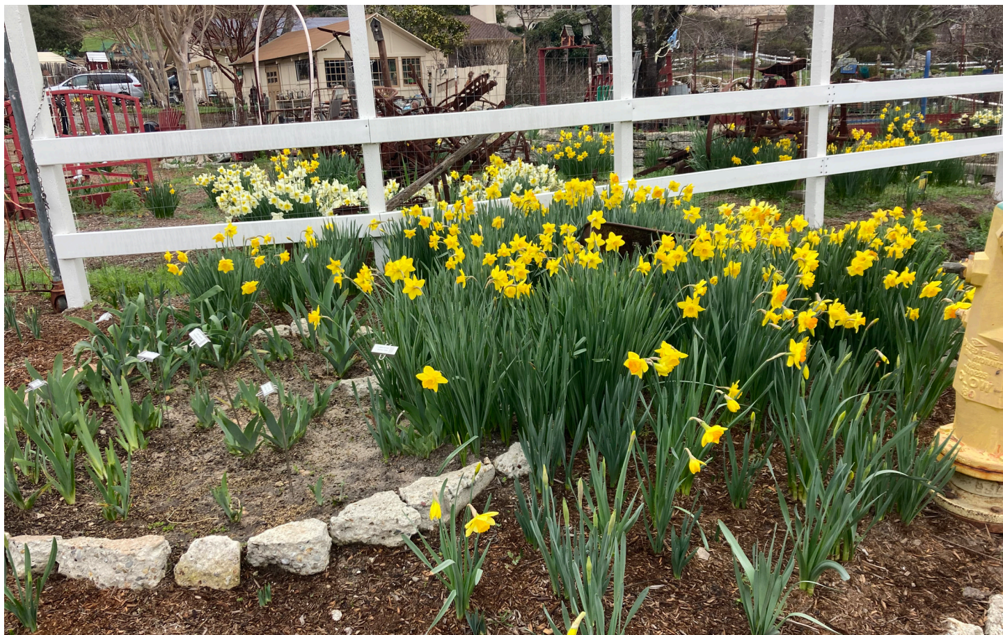
Sea of Yellow at the Cummins