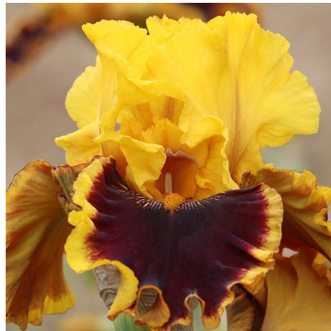
15. MIND BLOWING, Johnson, 2020