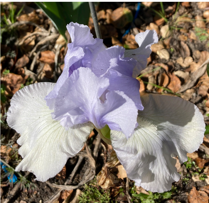
Perfect Couple, Ghio, 1984