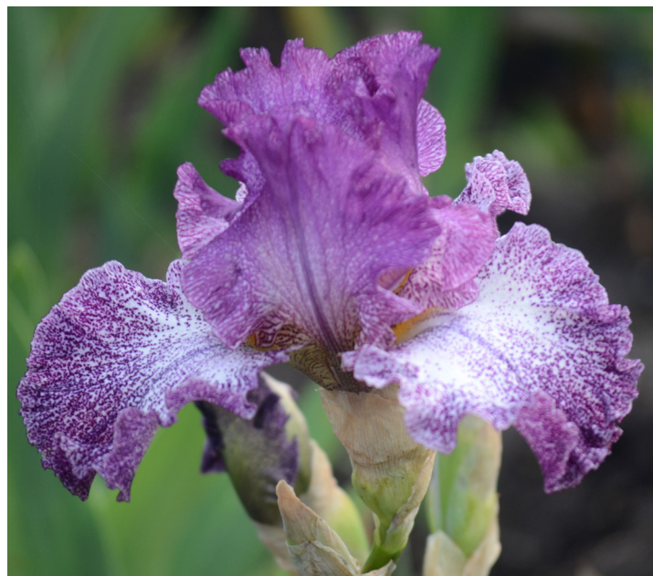
Autumn Explosion, Tasco, 2013