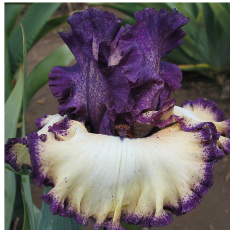
4. BERRY DELIGHT, Mego