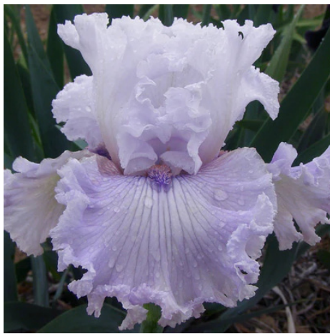
14. LAVENDER FIZZ, Sutton, 2020