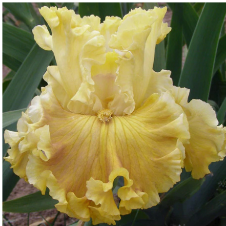
5. BUTTERSCOTCH LATTE, Sutton, 2022