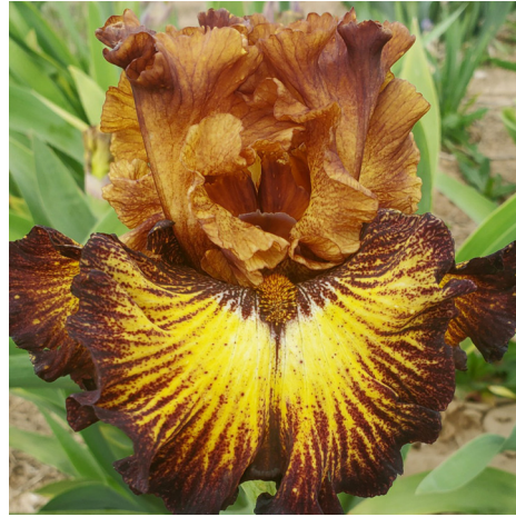
9. ELECTRIFIED, Sutton, 2022