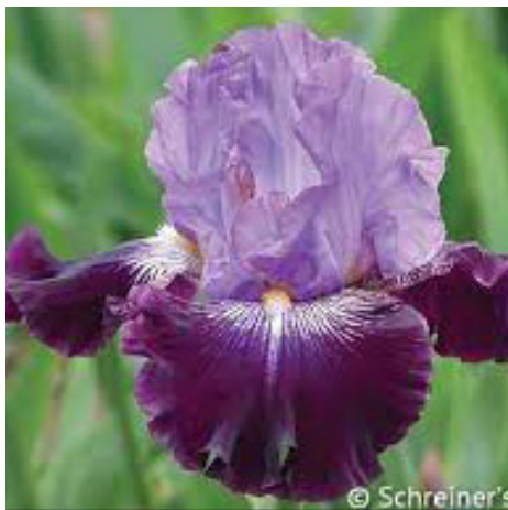
20. SEW LITTLE TIME, Schreiner