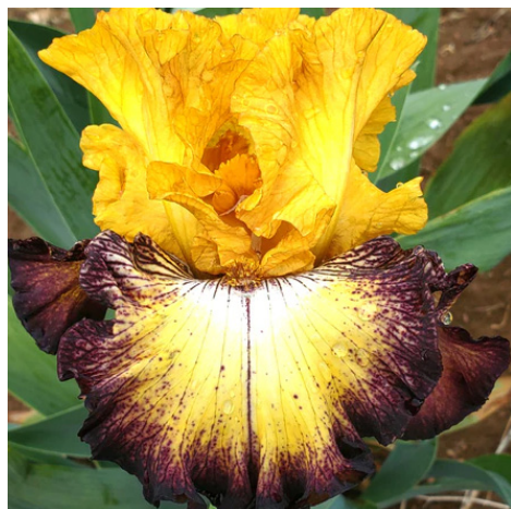
28. WHOA NELLY, Sutton