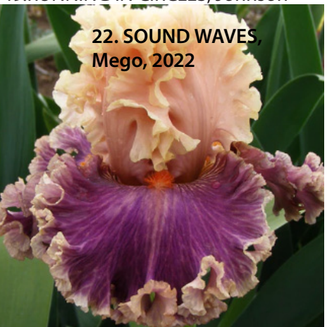
22. SOUND WAVES, Mego, 2022