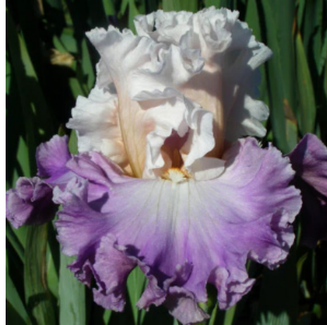
20. POWER BALLAD, Sutton, 2023