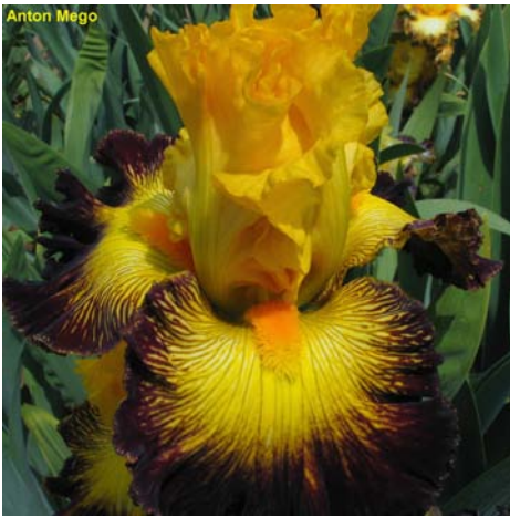
13. LIGHT SWITCH, Mego, 2023