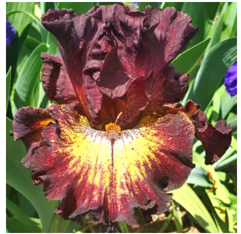
15. MIGHTY POWER, Sutton, 2023