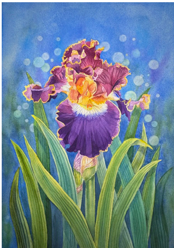
Iris painting by Sharon Medler

We are looking for any form of wall art that can be safely hung, such as: Framed paintings, prints, photography, and other pieces of framed art.