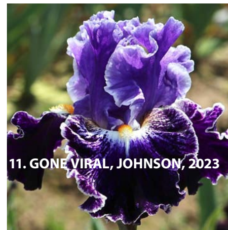
11. GONE VIRAL, JOHNSON, 2023