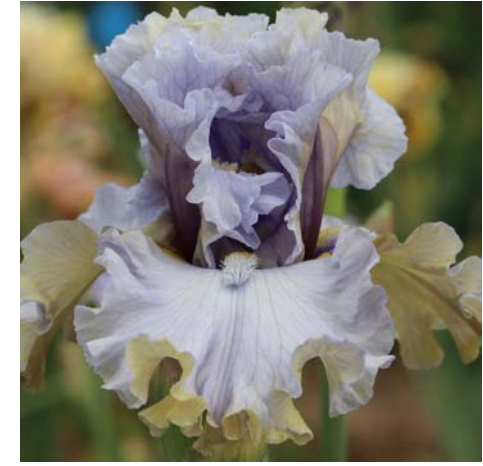
30. ZERO GRAVITY, Johnson, 2023