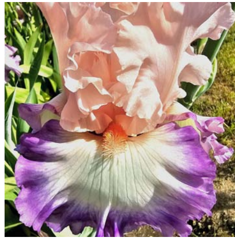
26. VICTORIAN QUEEN, Tasco