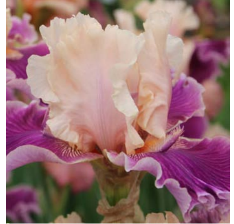
21. RED FROG FLYING, Skaggs