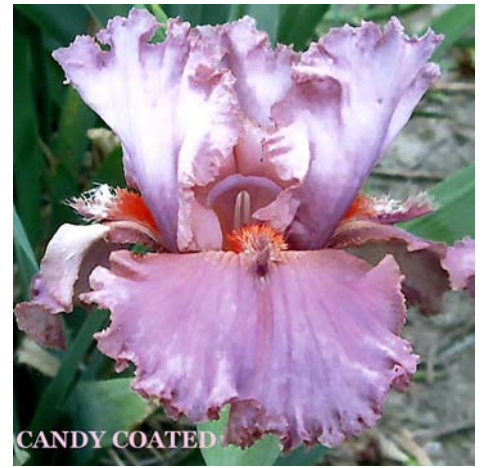
3. CANDY COATED, Burseen, 2022