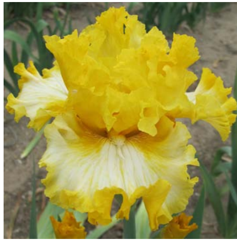
2. BLIND LUCK, BURSEEN, 2022