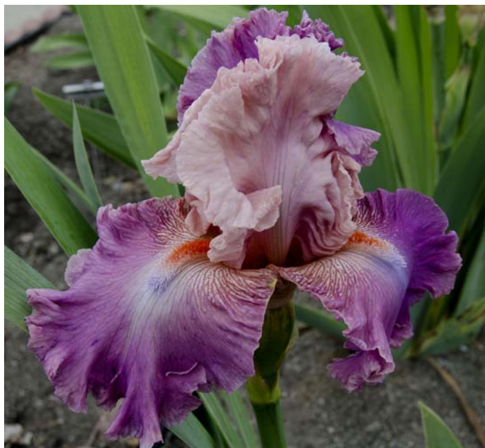
Velvet Valentine, Tasco, 2015

Wayne Crabbs wayne@lomaprieta.us 408 353-4089