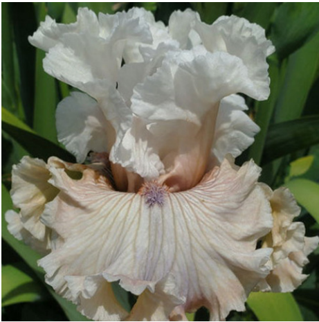
4. CASUAL COMFORT, Sutton, 2023