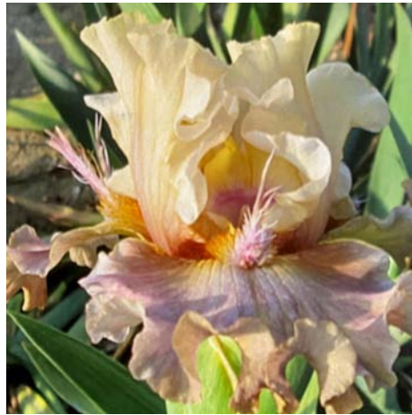
5. CHARMING OAKIE, Burseen, 2023