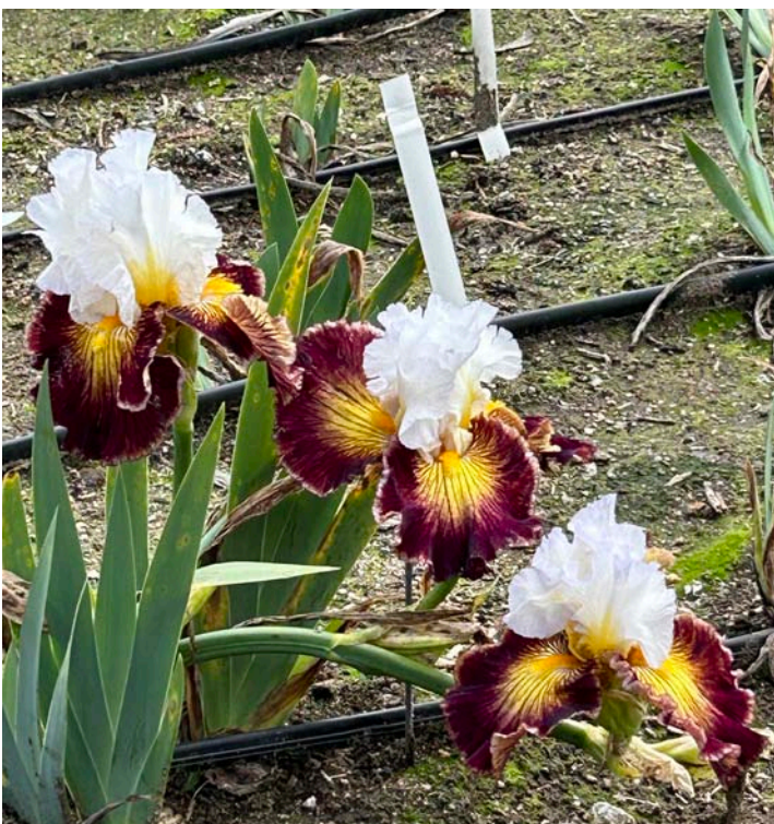
Centennial Celebration, Ford, 2019