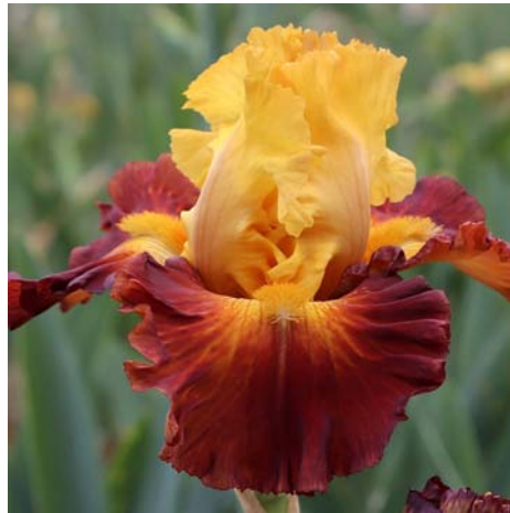
8. CRASH BANG, Black