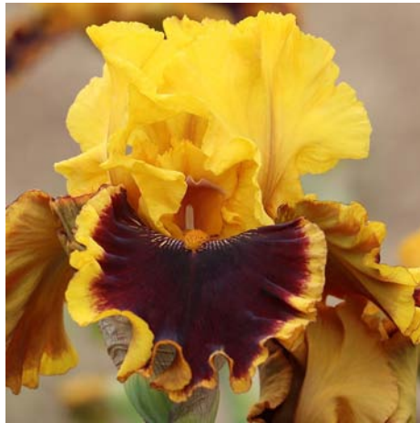
16. MINDBLOWING, Johnson, 2020