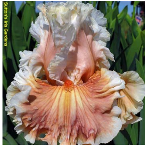
17. OBJECT OF AFFECTION, Sutton, 2023