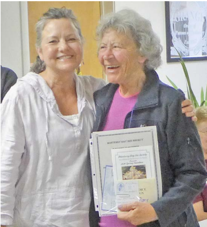
People's Choice Artistic