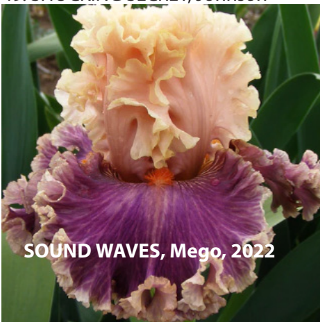
SOUND WAVES, Mego, 2022