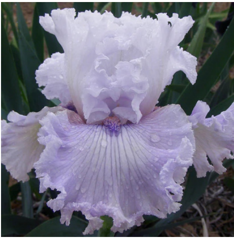
13. LAVENDER FIZZ, Sutton, 2020