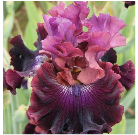
15. MYSTERY MAN, Keppel