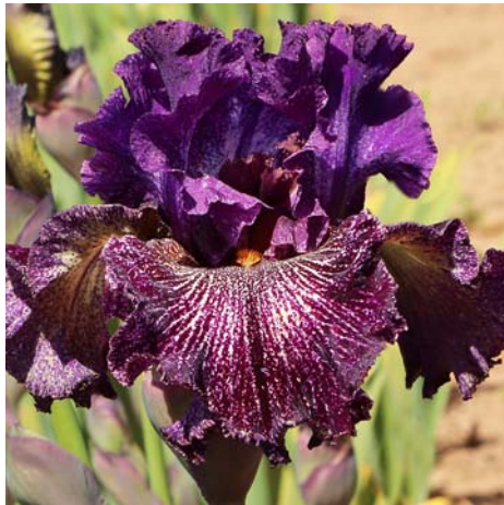
4. BOYSENBERRY DRIZZLE, Black