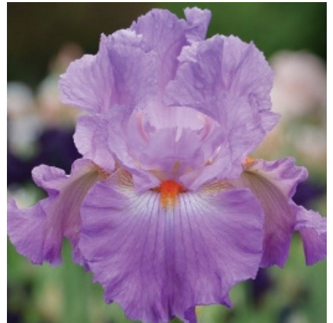
18. SCRUMDIDDLYUMPTIOUS, Schreiner