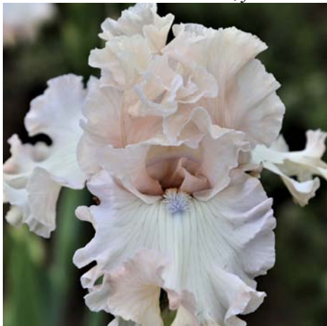
20. SNOW KISS, Keppel