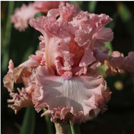
5. DEVOTED TO YOU, Johnson