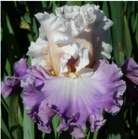
16. POWER BALLAD, Sutton