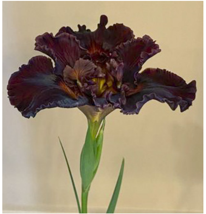
Best of section winner, PCI Fire Alert, Ghio