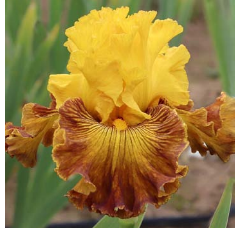
6. EARTH AND SUN, Black