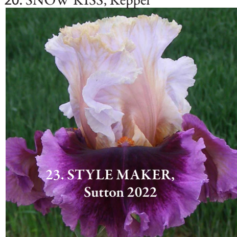
23. STYLE MAKER, Sutton 2022