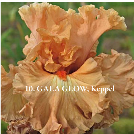
10. GALA GLOW, Keppel