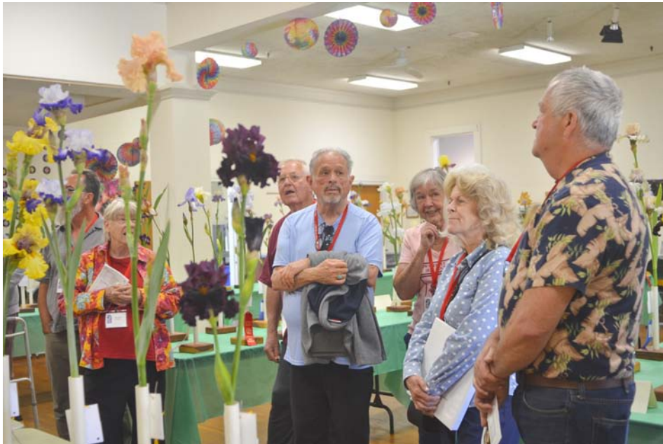
Judging the show

Next meeting Friday 21, 2024 Eating Starts 7:00 P.M. Meeting 7:30 P.M. Place Aptos Grange, 2555 Mar Vista Drive, Aptos