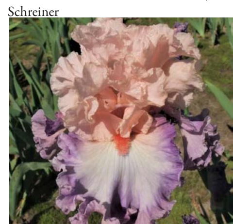
21. SOMEBODY SPECIAL, Keppel