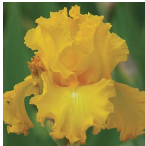
2. BIG AS THE MOON, Schreiner