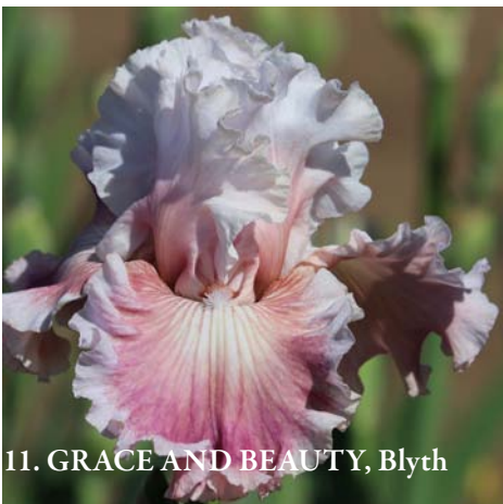
11. GRACE AND BEAUTY, Blyth