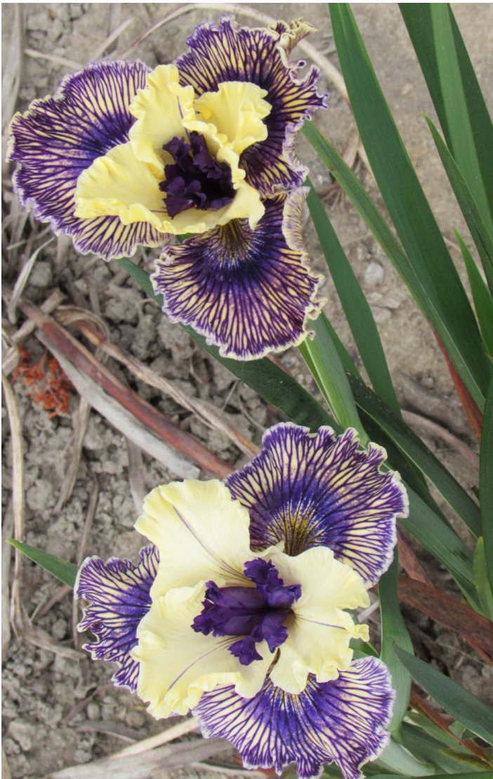
Ghio PCI seedlings