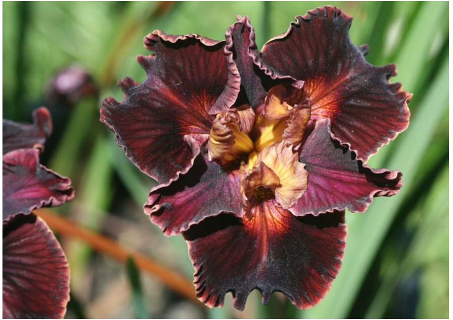
Red Zone, Ghio, 2019

Once more members need to bring any and all surplus beardless iris plants including PCIs. November is the month the regular door prize drawing returns.