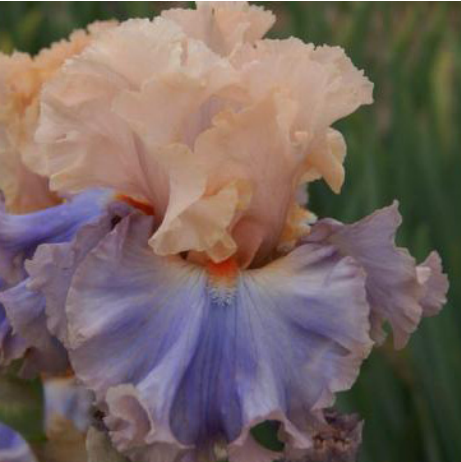
7. Canterbury Belle, Keppel