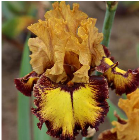
28. Upscale, Keppel