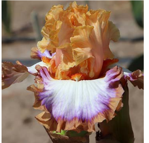
9. Coloring Book, Black