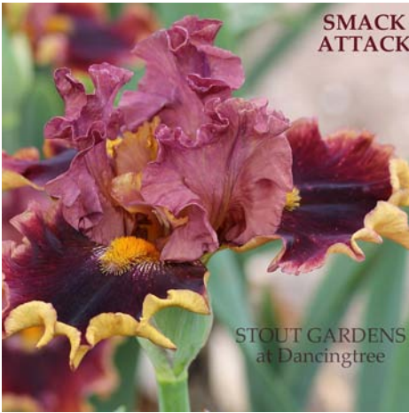
25. Smack Attack, Stout, 2019