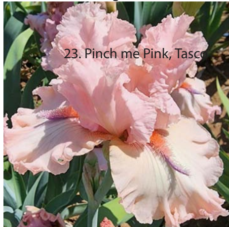
23. Pinch me Pink, Tasc...