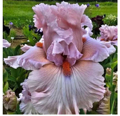
3. Bonnie's Pleasure, Tasco