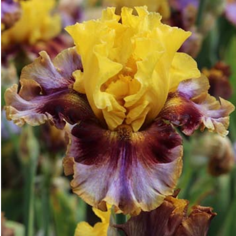
4. Born To Party, Johnson, 2023