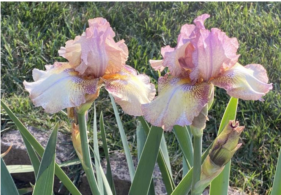
Happy New Year, Byers, 1989