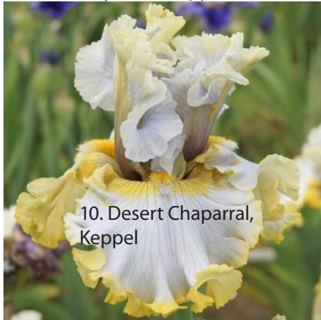
10. Desert Chaparral, Keppel