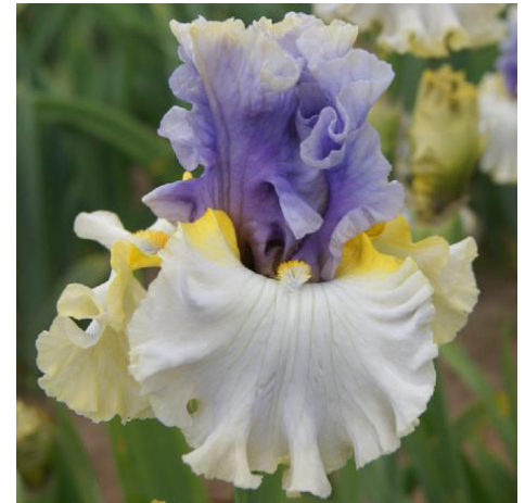
30. Wintercrest, Keppel