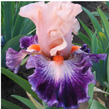
19. Memories of Home, Mego