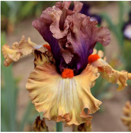
1. Amazon Sunset, Keppel