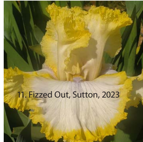
11. Fizzed Out, Sutton, 2023