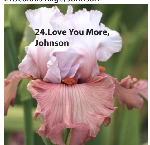
24. Love You More, Johnson