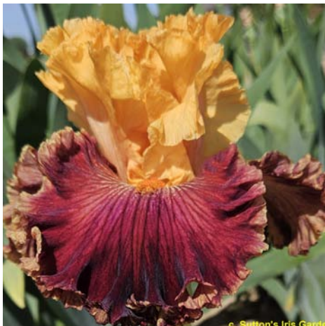
17. Harvest Glow, Sutton