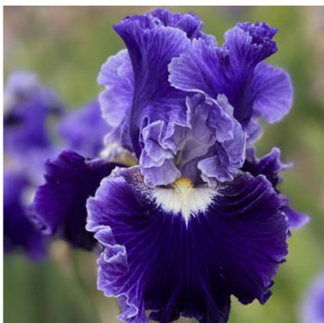
32. SWIRLING SURF, KEPPEL