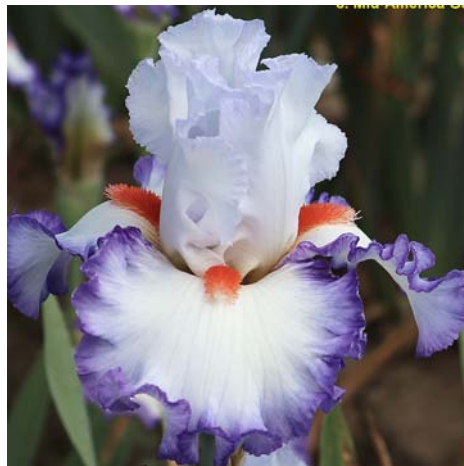
14. Feel the Magic, Black