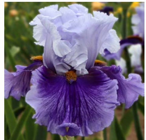
9. Butterfly Eye, Black