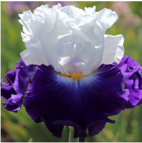
1. Angel Falls, Black