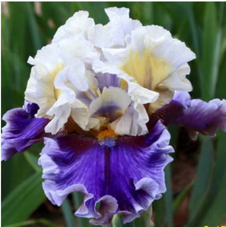
4. Beyond Fabulous, Black