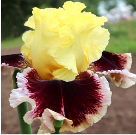
5. Boom Box, Black