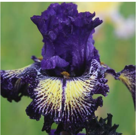
16. Ground Rules, Keppel