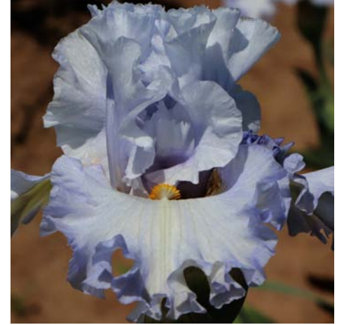
6. Bouncing Blue Betty, Black