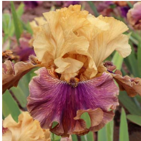
8. Brown Nose, Black