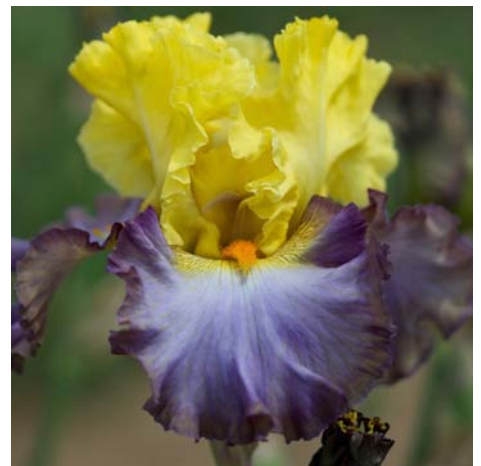
15. Goddess of the Rainbow, Miller