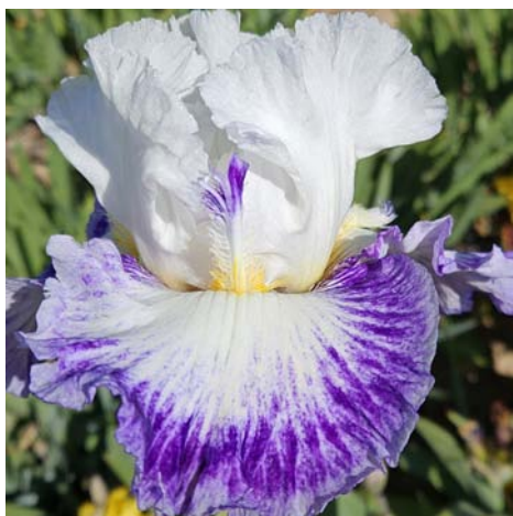
25. Mak Attack, Sutton