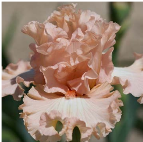
31. Sunday's Best Dress, Sutton