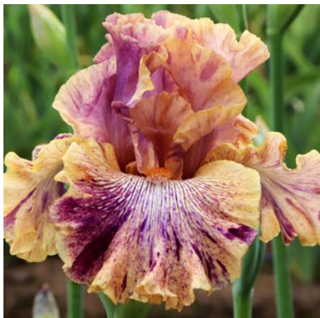
28. Peach Berry Jumble, Black