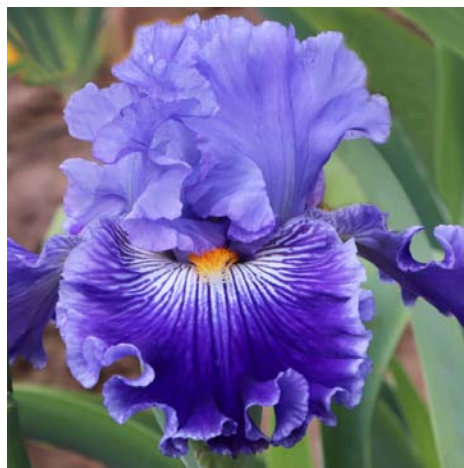
2. Atlantic Blue, Black