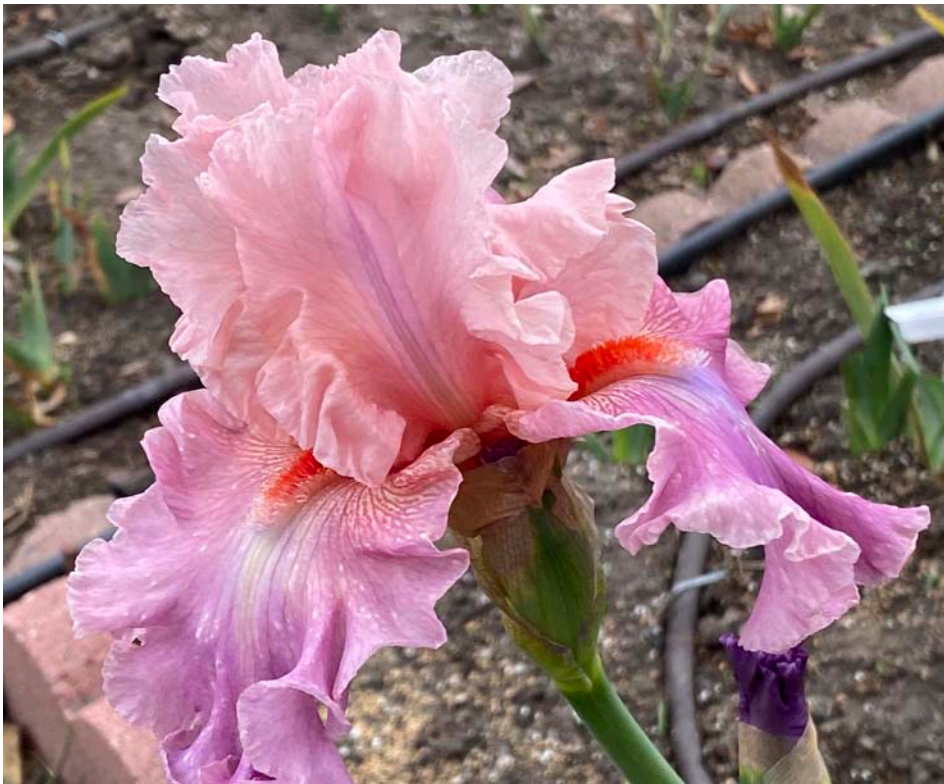
Velvet Valentine, Tasco, 2015