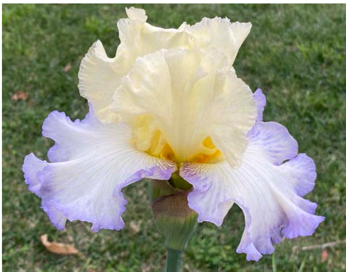
Boundless