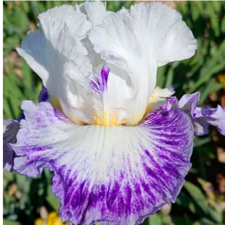
28. Mak Attack, Sutton