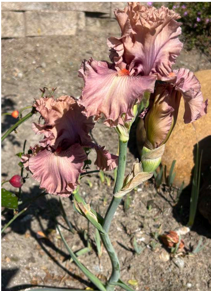
Good Morning Beautiful, Stanton, 2015