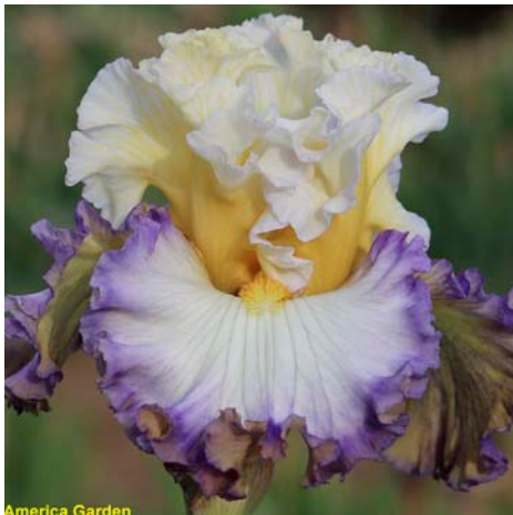
4. Beautiful Mind, Johnson