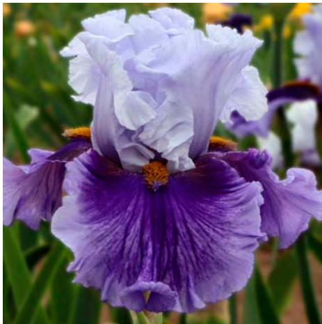
7. Butterfly Eye, Black