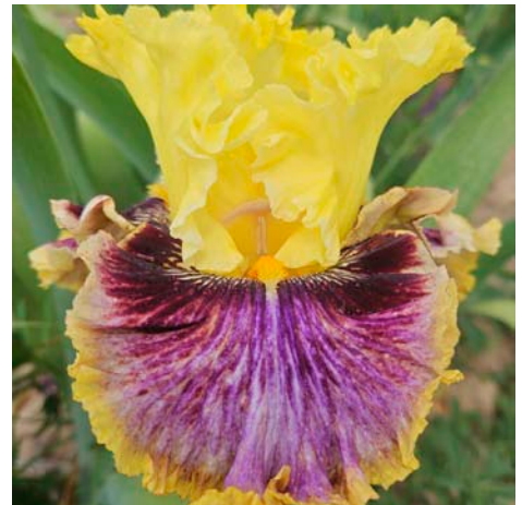
30. Next Level, Mego