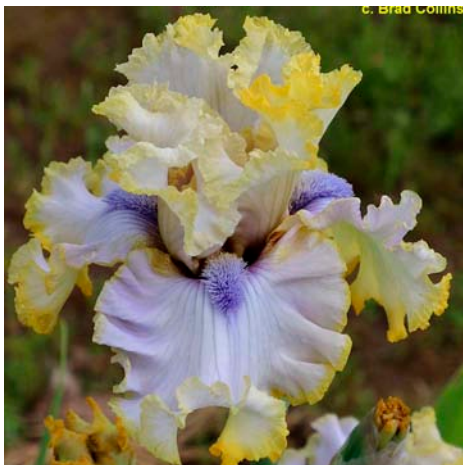
16. Gift Wrapping, Keppel