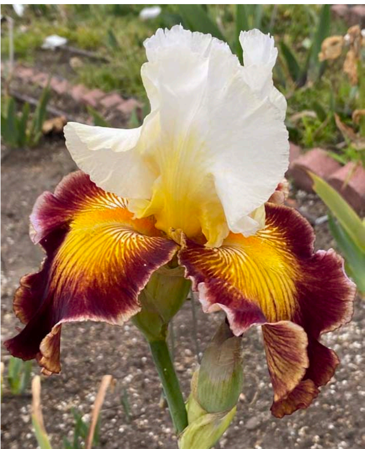
Centennial Celebration, Ford, 2019