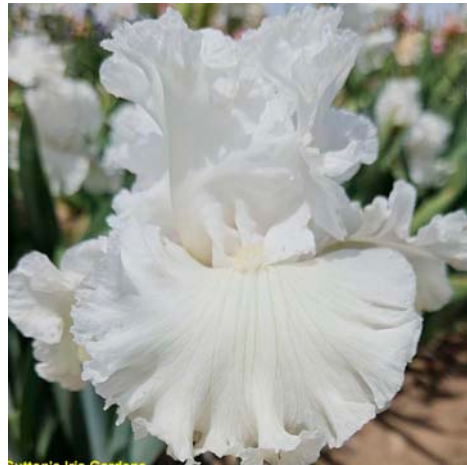
21. Just Breathe, Sutton