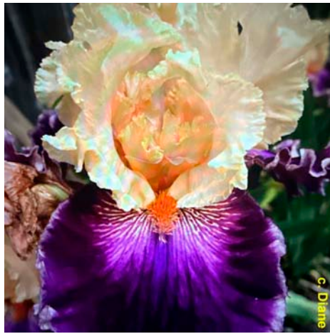
2. Ballerina's Tutu, Sampson