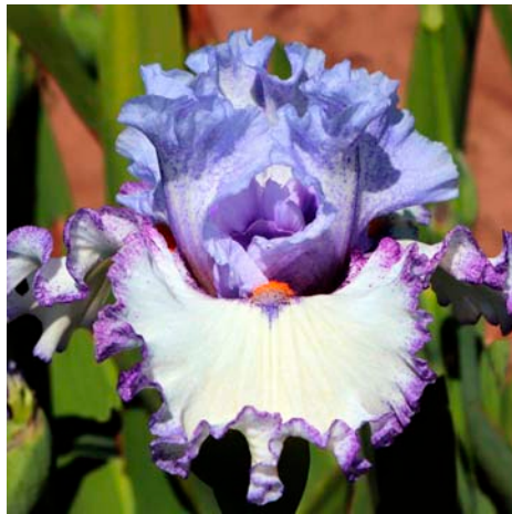
26. Magic is Happening, Black