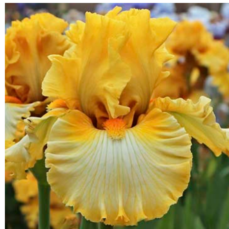
15. Getting Some Sun, Black