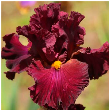
14. Full Power, Keppel