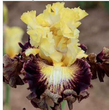
8. Causing a Commotion, Johnson