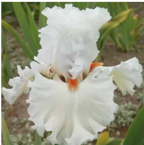
13. For Dessert, Keppel