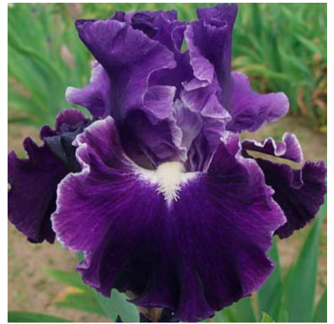
3. Batgirl, Keppel, BB