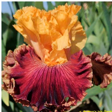
17. Harvest Glow, Sutton