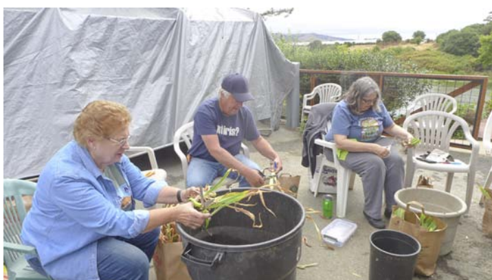
Labeling the doorprize iris for the picnic