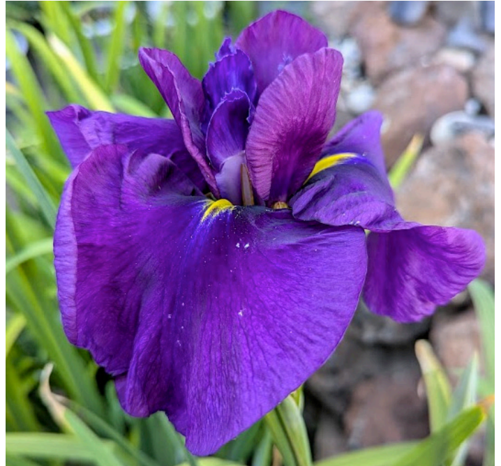
Simple Grace, Harris, 2019, JJ

Bring your rebloomer to share! First drawing goes to those who have brought blooms. Rebloomer drawing starts in August and goes until February.