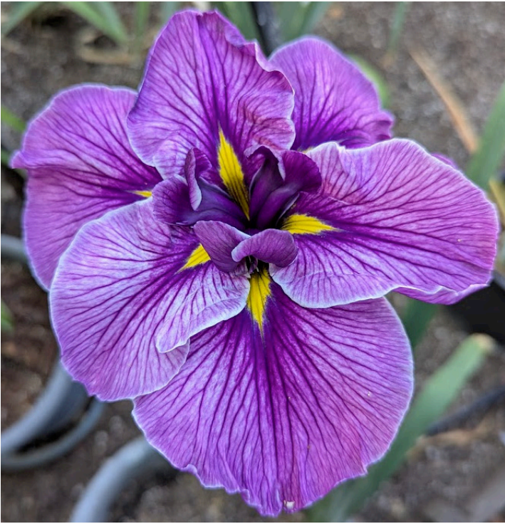
Dark Spell, Aitken, JI, 2019