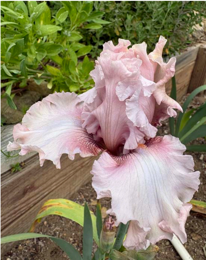
Chivalrous, Ghio, 2016