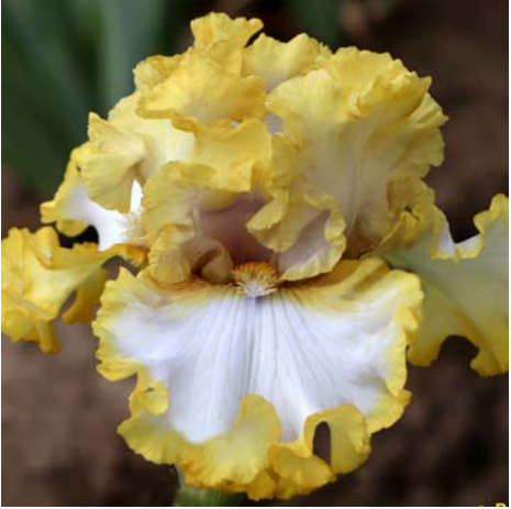
5. Box of Sunshine, Black