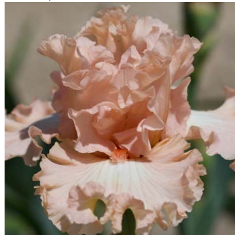
29. Sunday's Best Dress, Sutton