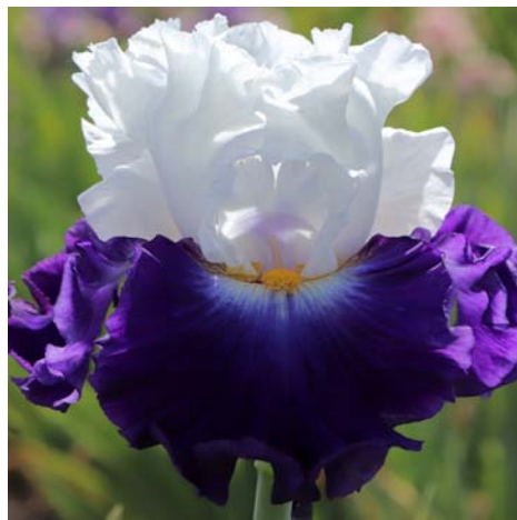
2. Angel Falls, Black