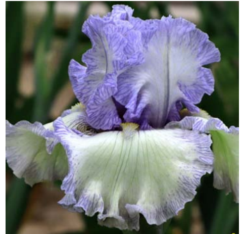
33. Witches Stitches, Black