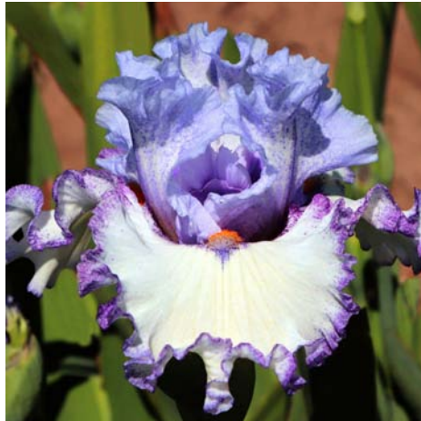
17. Magic is Happening, Black