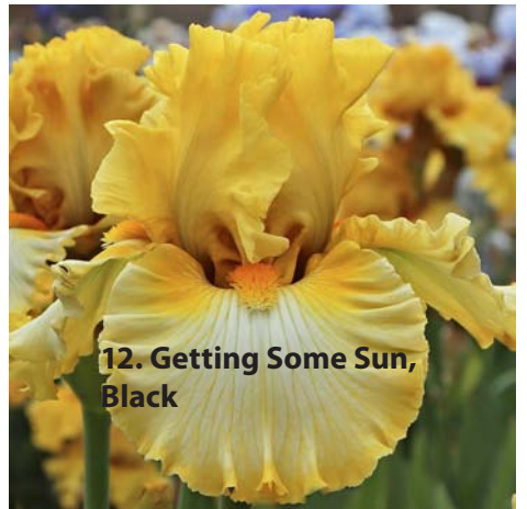
12. Getting Some Sun, Black