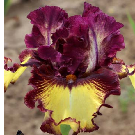
7. Calypso Joe, Black