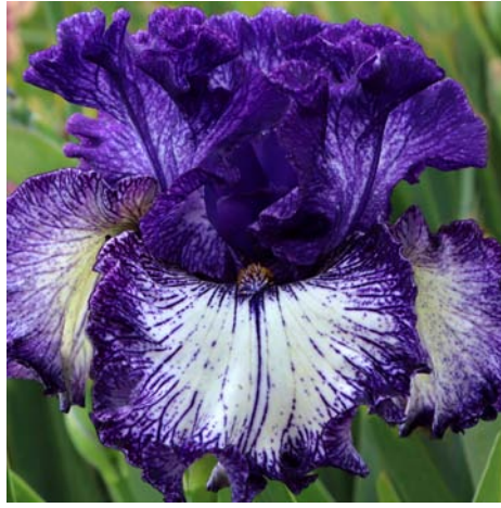
26. Stripes are In, Black