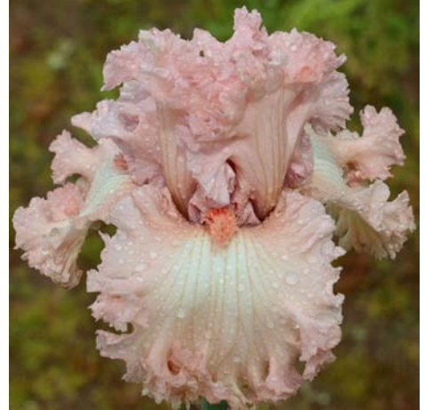
21. Party Belle, Keppel