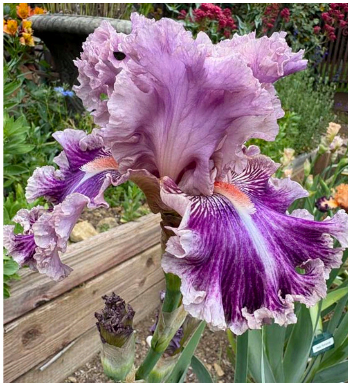
Just Witchery, Blyth, 2012