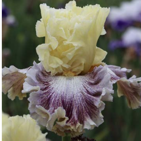
20. Only Imagine, Johnson