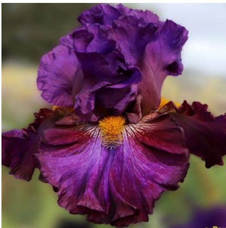
1. Accent on Color, Black