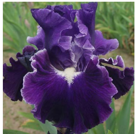
3. Batgirl, Keppel, BB