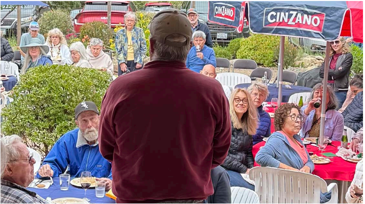
Craig addressing the gathering