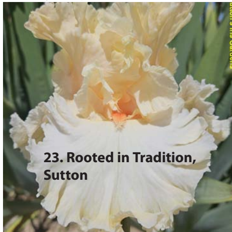
23. Rooted in Tradition, Sutton