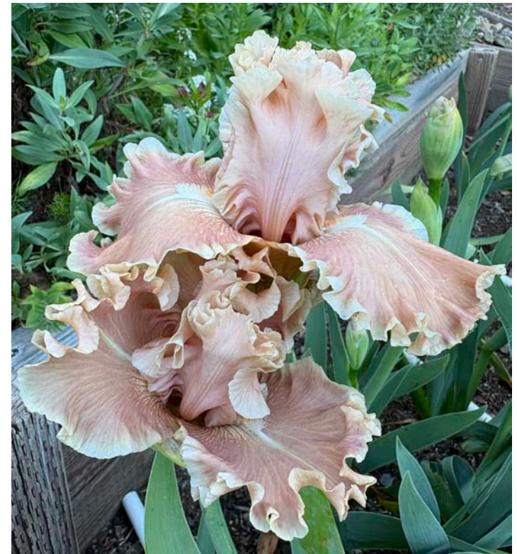
Hello Romance, Blyth, 2019